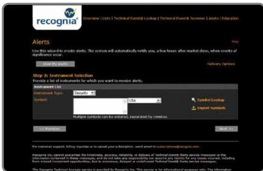
Create a Watch List to focus on the markets and instruments of interest to you.