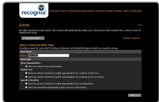
Customize your Alerts so you are informed of critical Technical Event occurrences in your space.