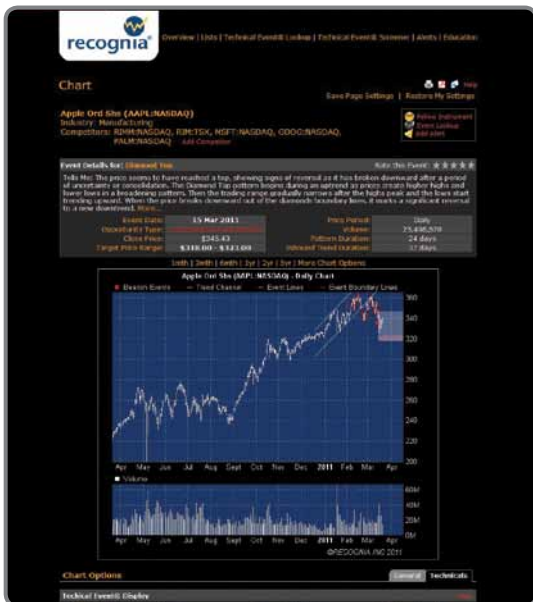
View the Technical Event details to compliment your other investment research, and help identify possible entry and exit points for trades.